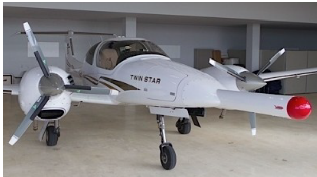
TOTEM-2A VLF Nose Stinger

The TOTEM-2A can be configured to measure two VLF transmitting stations simultaneously, which results in greatly improved data quality for two important reasons. First, the likelihood of finding conductive bodies that strike in different directions is enhanced. Secondly, responses from more than one transmitter can be correlated to verify the results of each measurement, thereby resulting in better confidence in the data and thus better interpretations.